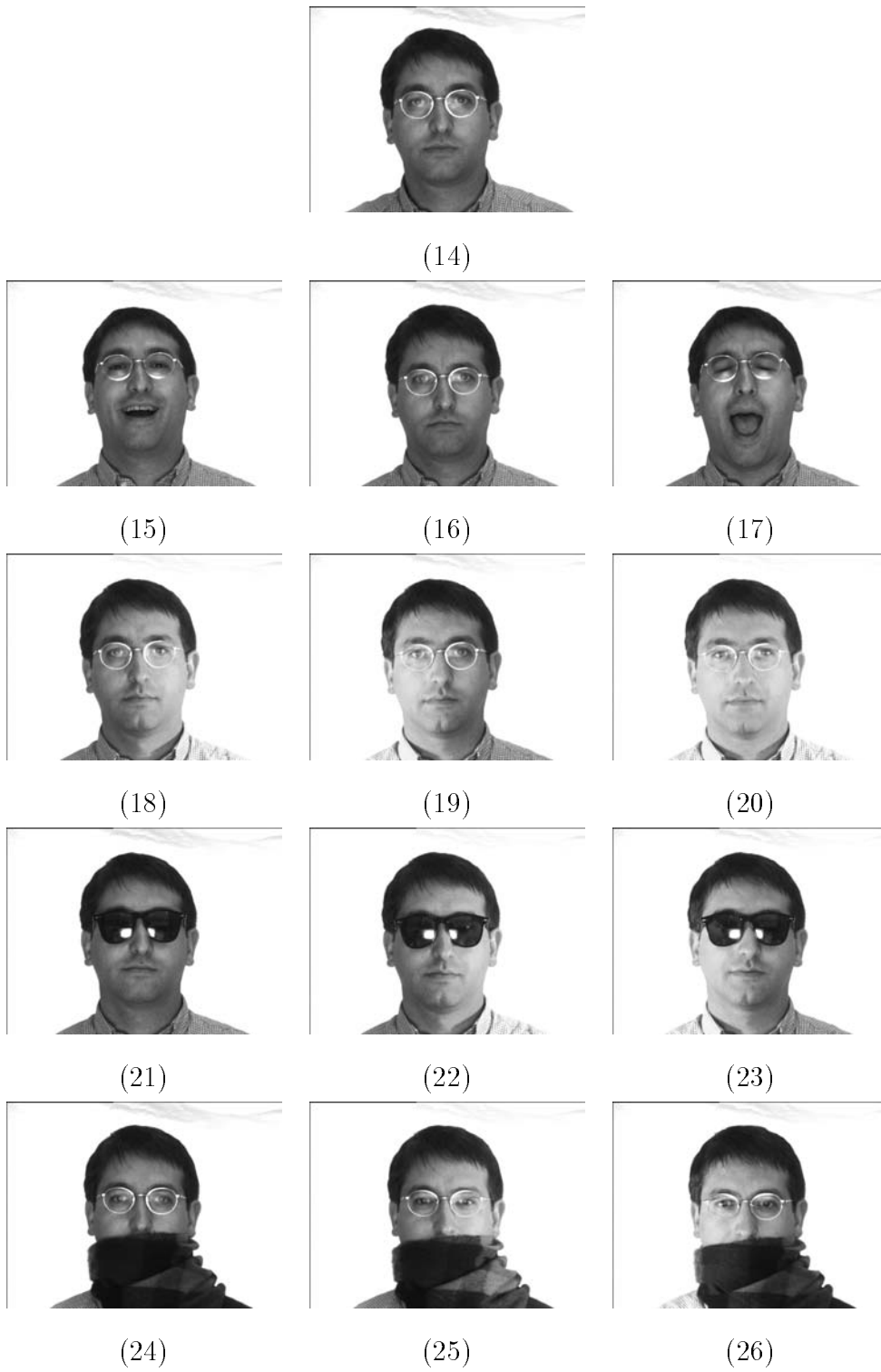
Figure 3: Example of the images acquired during the second session.