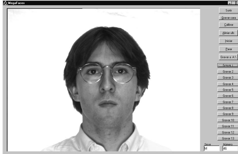
Figure 1: The application used.